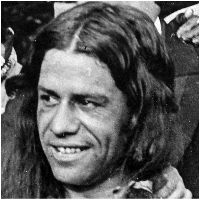
Young Deer, 1909 at Bison.

The Mysterious Identity of the Pathè Producer Finally Comes to Light